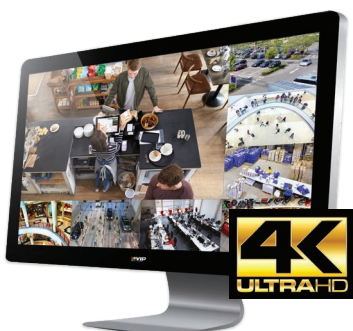
Ultra HD Record & Live View