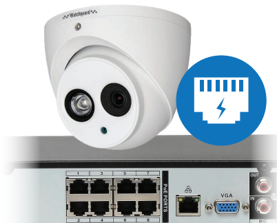
Built-in Power over Ethernet