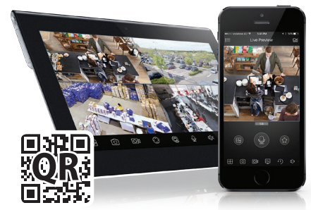
Comprehensive Remote View